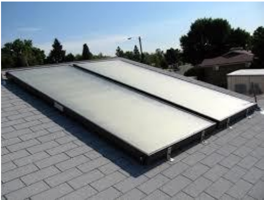
Figure 1. Solar Water Heater Panels (National Renewable Energy Laboratory)

There are basically two types of solar panels. They look similar but are very different in construction and function. A solar heat panel basically produces hot water or air and can be constructed of wood, tubing, and glass panels (Figure 1). A solar photovoltaic panel is made up of silicon wafers and converts sunlight into direct-current electricity which can power appliances (Figure 2). The silicon material is very advanced, and these panels must be bought from manufacturers.