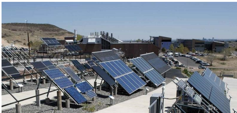
Figure 2. Solar Photovoltaic (Electric) Panels (National Renewable Energy Laboratory)